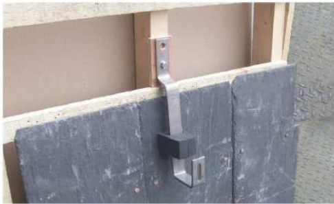
Step 1: Fix foam to bracket drop.