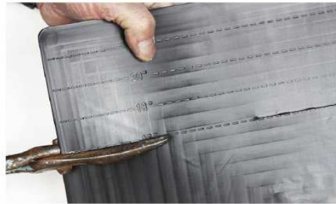
Step 2: Slate sizes are marked on the SolarFlash.