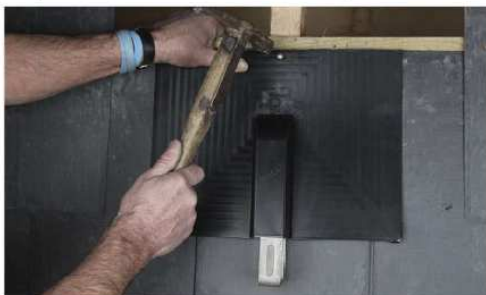
Step 3: SolarFlash can be trimmed or nailed through. If nailing through, ensure relevant line for slate size centres on the batten. Apply pressure to hold SolarFlash solid when nailing through.