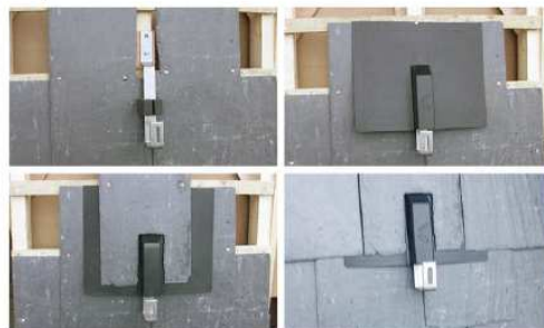
Step 4: Cut slates around the hood of the SolarFlash as per Page 4.