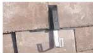
Hardrow Concrete Slate

Also works with all flat profile interlocking tiles.